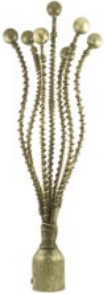
Bonsai #201091 3 1/2"W, 8"L *shown in AB