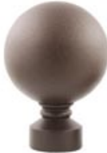
Ball #201055 1 3/4"W, 2 1/2"L *shown in MB