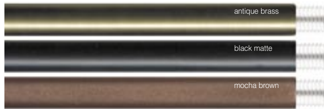
Steel Tubing #207012 - 3/4"D, 47"L #207015 - 3/4"D, 59"L #207018 - 3/4"D, 71"L *splice included