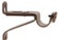
Thrifty adjustable #202074 3/4"W, 2 7/8" to 3 3/4"P