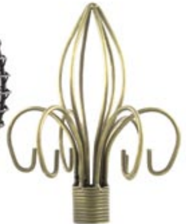
Iris #201058 4 1/2"W, 5 3/4"L *shown in AB