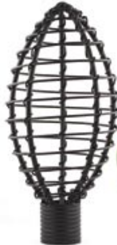
Ellipse #201086 2 5/8"W, 5 3/4"L *shown in BL