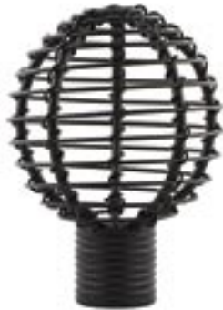
Sphere #201085 2 5/8"W, 3 1/2"L *shown in BL