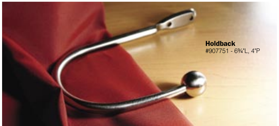
Holdback #907751 - 6 3/4"L, 4"P