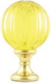
#581242 blown lead crystal 4"W, 6 1/8"L