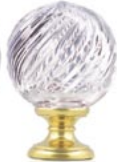
#581224 blown lead crystal 4"W, 5 1/2"L *low base