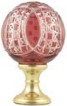
#581268 (R,G,B) blown lead crystal (2-colored) 4"W, 6 1/8"L