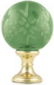
#581247 blown lead crystal 4"W, 6 1/8"L *carved

Use this color key to specify crystal color other than clear (for blown finials) when you place your order. Finial bases are standard in polished brass but you may specify antique brass, brushed brass, brushed nickel, old black or polished chrome for an additional charge.