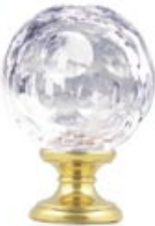
#581226 blown lead crystal 4"W, 5 1/2"L *low base