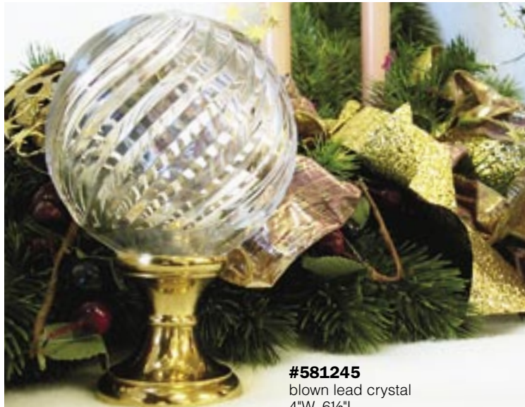
#581245 blown lead crystal 4"W, 6 1/8"L