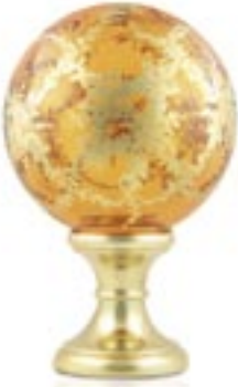
#581251 blown lead crystal 4"W, 6 1/8"L *painted